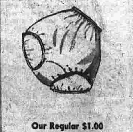
Our Regular $1.00 NYLON BRIEFS